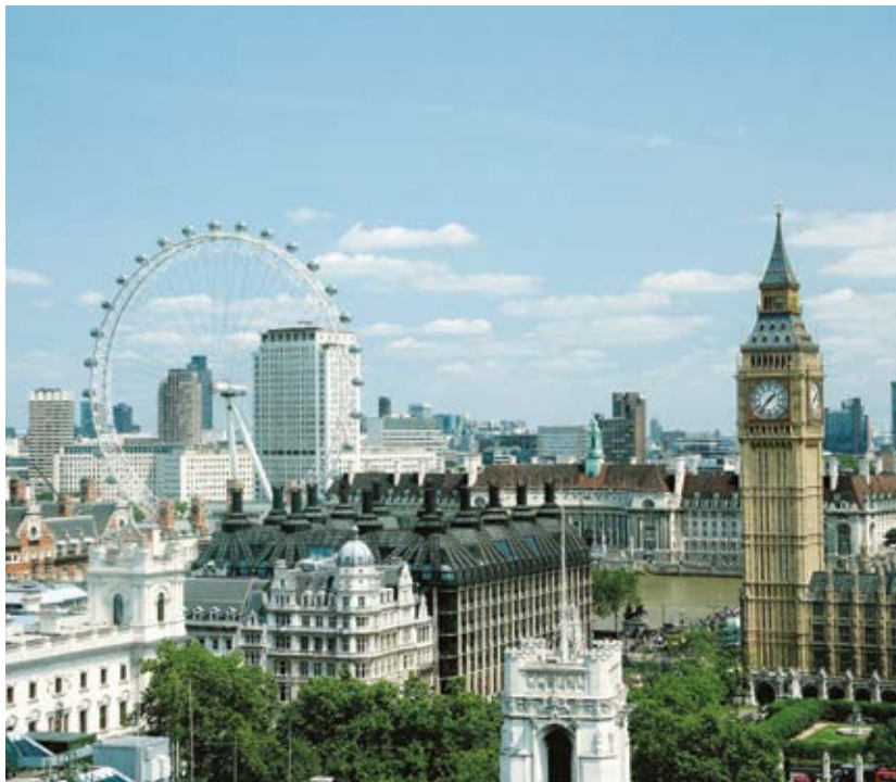
Central Hall Westminster | Case Study